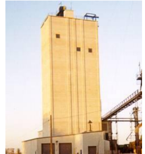
Feed mill, Larrabee, IA

AMES, IOWA (4.06.09) – On April 1, 2009, FC acquired an ownership position in Feed Partners LLC and its feed mill at Larrabee, IA. Effective immediately, FC will be able to supply customers with quality feed from the Larrabee mill. This concrete feed mill, which was constructed in 1999 and is fully automated, will allow FC to further serve its feed customers in the region.